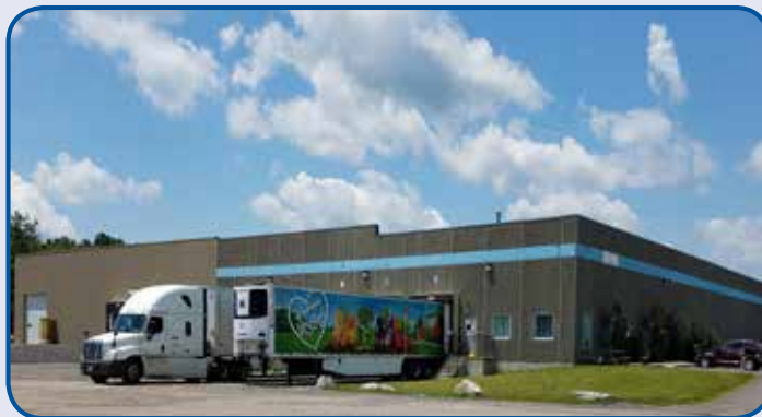
Tosca doubled the size of its Hazleton facility and will capitalize on Hazleton’s business infrastructure to continue to grow its operations.