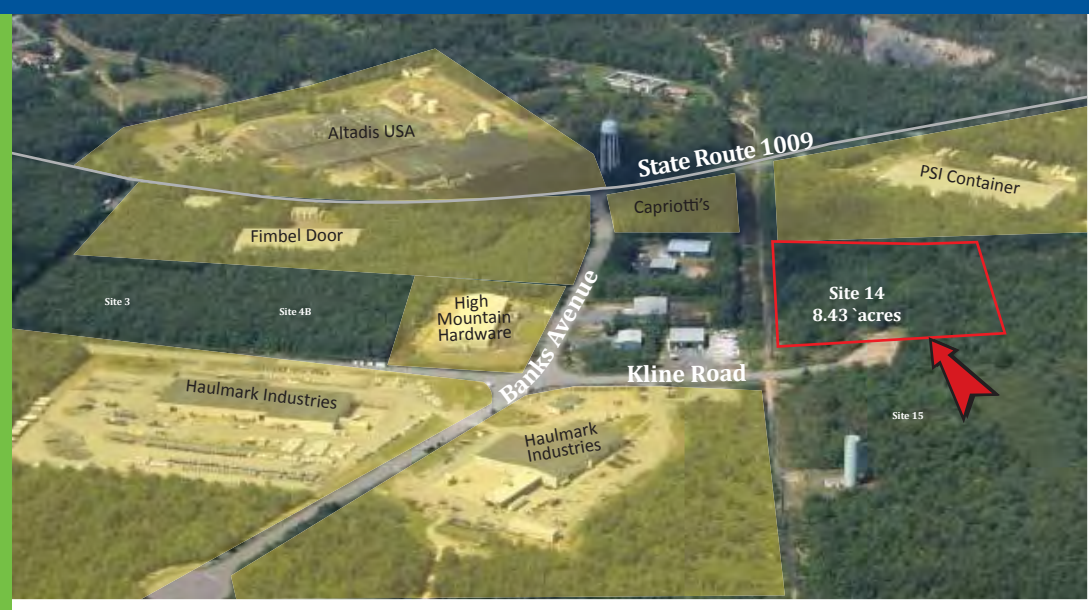
Industrial site suited for Manufacturing / Distribution / Warehouse

McAdoo Industrial Park is located right outside of Hazleton in Banks Township, Carbon County, just 3 miles from Exit 138 of Interstate 81 via SR 309. The industrial park has over 100 acres of fully developed sites available with infrastructure already in place. McAdoo Industrial Park is home to industries like Altadis USA, PSI Container, and Haulmark Industries.