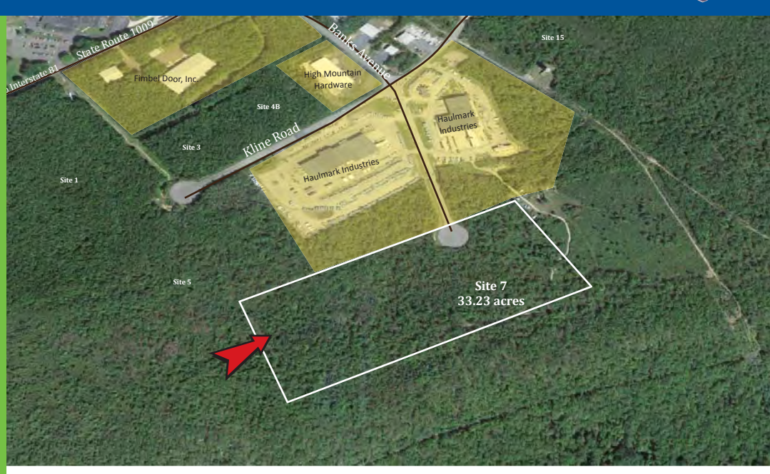
Industrial site suited for Manufacturing / Distribution / Warehouse

McAdoo Industrial Park is located right outside of Hazleton in Banks Township, Carbon County, just 3 miles from Exit 138 of Interstate 81 via SR 309. The industrial park has over 100 acres of fully developed sites available with infrastructure already in place. McAdoo Industrial Park is home to industries like Altadis USA, PSI Container, and Haulmark Industries.