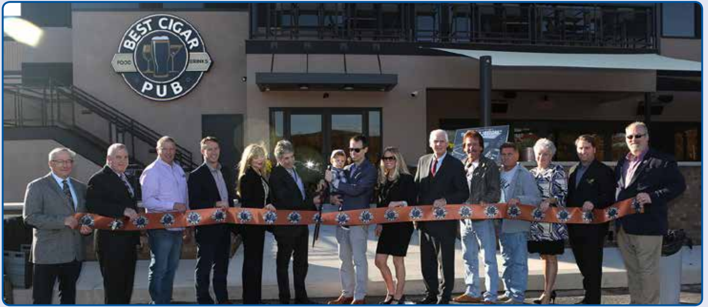
Best Cigar Prices worked with CAN DO officials for the guidance the company needed to complete a multimillion dollar expansion project at its CAN DO Corporate Center facility less than 10 years after locating in the area.