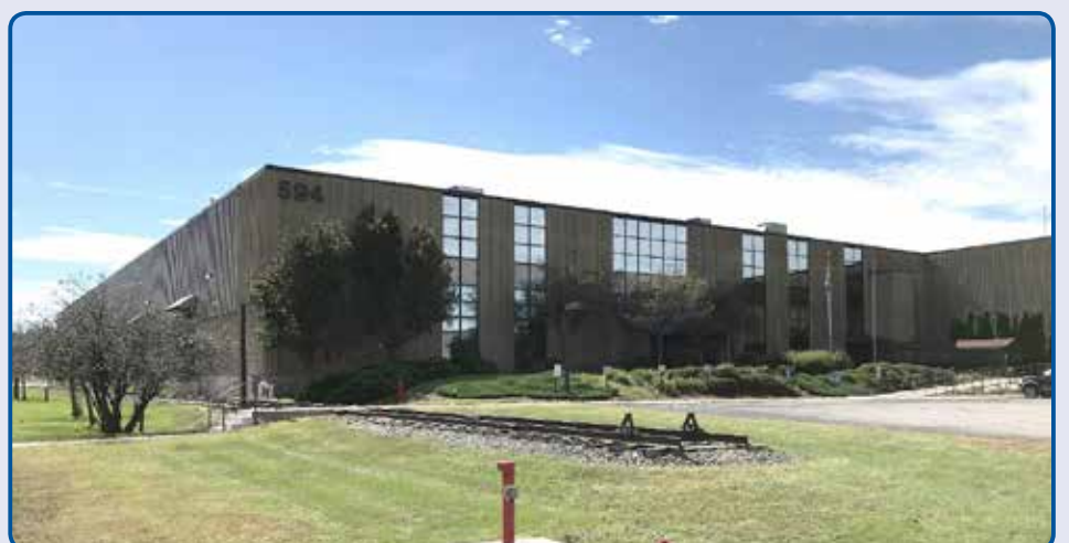
Pro Con signed a lease for a 242,960 square foot facility in the Humboldt Industrial Park. This is the company's third facility in Greater Hazleton.

Pro-Con recently completed a lease agreement with Endurance Real Estate Group on a 242,960 square-foot distribution center located along Route 924 in Humboldt. The building is within minutes of access to Interstate 81 and only a few miles from the junction of Interstate 80. This easy access to major highways allows the company to provide