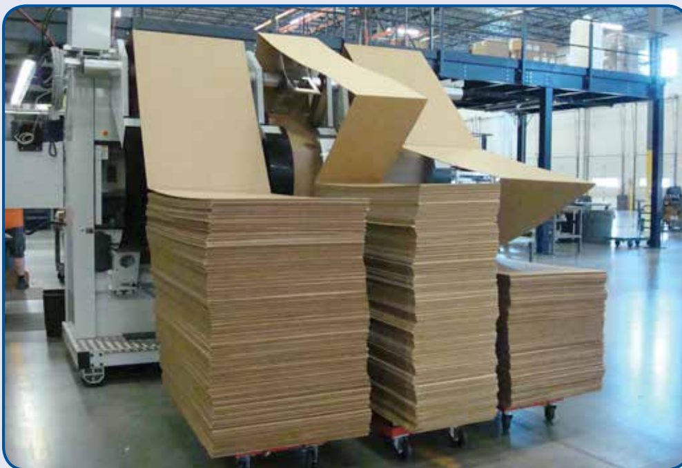
Corrugated Supplies Company is the largest independent sheet feeder in the United States. Its sheets are used to make various items, including boxes, point of purchase displays, packaging.

"Another unique amenity is reliable rail service in the park. Corrugated Supplies Company is a rail user that will take advantage of this great amenity. Lastly, the project has the benefit of robust utility services – gas, electric, water and sewer – that is unlike most projects in Pennsylvania," he said.