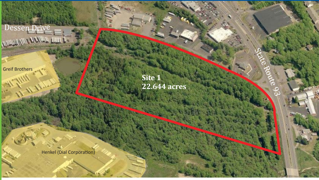
Industrial site suited for Manufacturing / Distribution / Logistics Potential for Commercial Use

Dessen Drive & State Route 93 West Hazleton, PA 18202